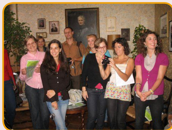
A tour of Maria Montessori's study

We would love to see more visitors and offer them our special hospitality.