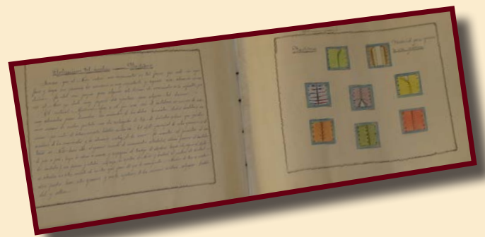
historical albums by Montessori students

Do you have something similar that will interest and encourage generations to come? If you do, we would like to offer your mementoes a permanent home in the Maria Montessori House.