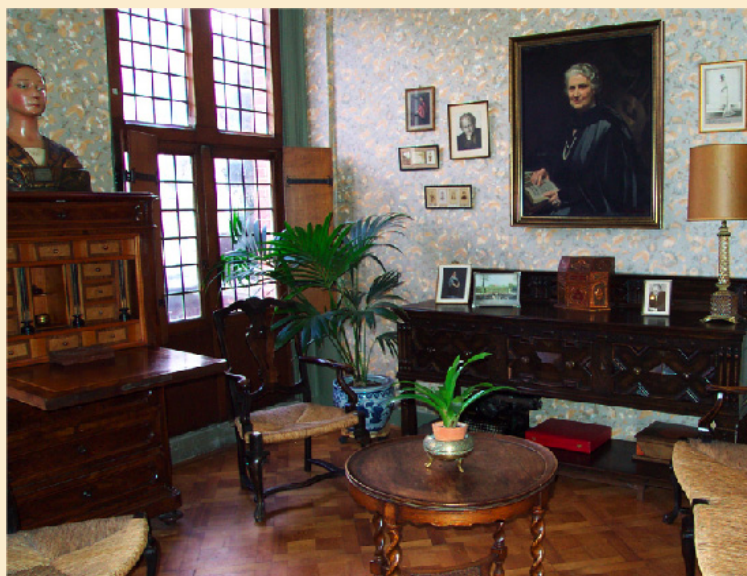
Maria Montessori's Study in Amsterdam